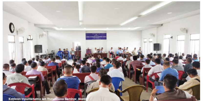
Kohhran Inpumkhatna leh Thawh Hona Seminar, Marm

9. Inpumkhatna leh thawh hona hi a tak taka kan kalpui dâwn a nih chuan a tua-te pawh hian kalsan tûr leh inhnuh hniamna tûr kan nei vekin a lang a, chu chu kan ngam hun hunah kohhran inpumkhatna leh thawh hona ţa chu kan nei thei mai ang.