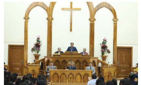
Synod Moderator-in tirh chhuahna hun a hmang

Kumina missionary tirh chhuahna hi SMB rawngbâwlna hmun hrang hrang 16-ah tirh darh an ni a, Kolkata Mission Field-a awm tûr 15 awmin, anni hi a hlâwm tam ber an ni. Missionary-a chhuak tharte hi mipa 30 leh hmeichhia 56 an ni a; Evangelist 49, Evangelist Teacher 27, Craft Teacher 6, Medical 3 leh Office Assistant 1 an ni. SMB chuan hêng missionary chhuak tharte tân hian kohhranhote t̄awngt̄aipui thîn tûrin a sâwm ni.